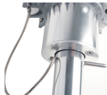
Manual Lift w/ Stainless Steel Security Pin