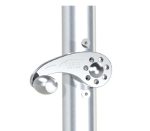
Easy Drive Crank Lift System