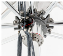
Patented Independent Bracket Hub System