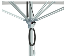
Auto-Loc Marine Pulley system