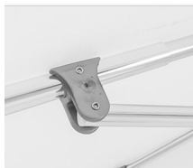
Reinforced Strut Joint Connector