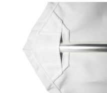
Ballistic-Reinforced Canopy Construction