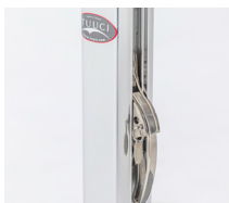
Cam Lock Lever - Allows 360° Rotation