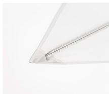
Ballistic Reinforced Screw Pocket Construction