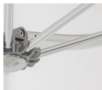
Easily Replaceable Parts