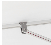
Reinforced Strut Joint Connector