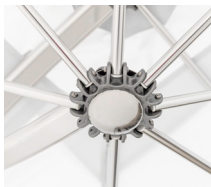
Patented Independent Bracket Hub System