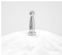
Stainless Steel Venice Finial