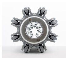
Easily Replaceable Parts