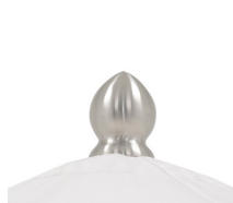
MAX Acorn Finial