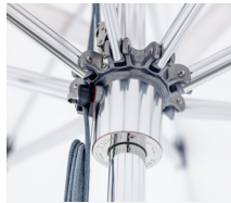
Patented Independent Bracket Hub System