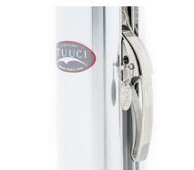
Cam Lock Lever - Allows 360° Rotation