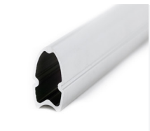
V-MAX Reinforced Strut Design