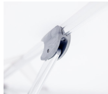
Reinforced Strut Joint Connector