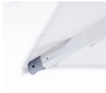
Ballistic Reinforced Screw Pocket Construction