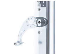
Telescoping Mast with EasyDrive Crank Lift System