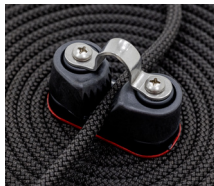
Auto-Loc Marine Pulley System