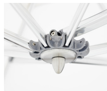
Easily Replaceable Parts