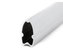
V-MAX Reinforced Strut Design