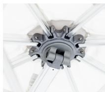
Patented Independent Bracket Hub System