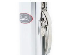
Cam Lock Lever - Allows 360° Rotation