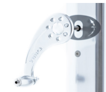
Telescoping Mast with Easy Drive Crank Lift System