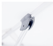
Reinforced Strut Joint Connector