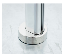
Cantilever Stem Cover Plate